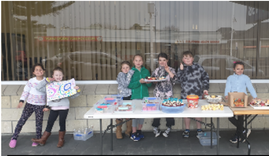
SPCA Cupcake Day