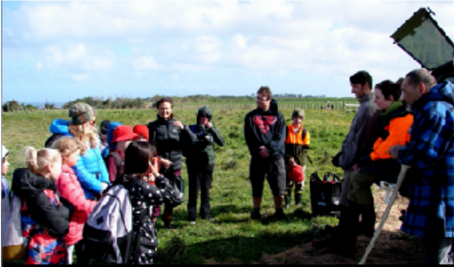
Ahikuku Planting Day