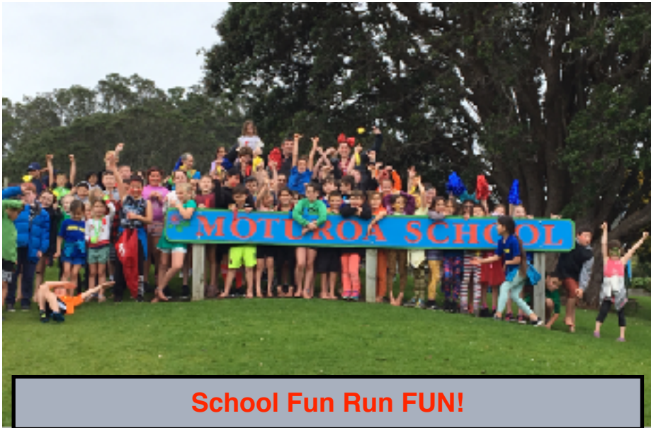
School Fun Run FUN!