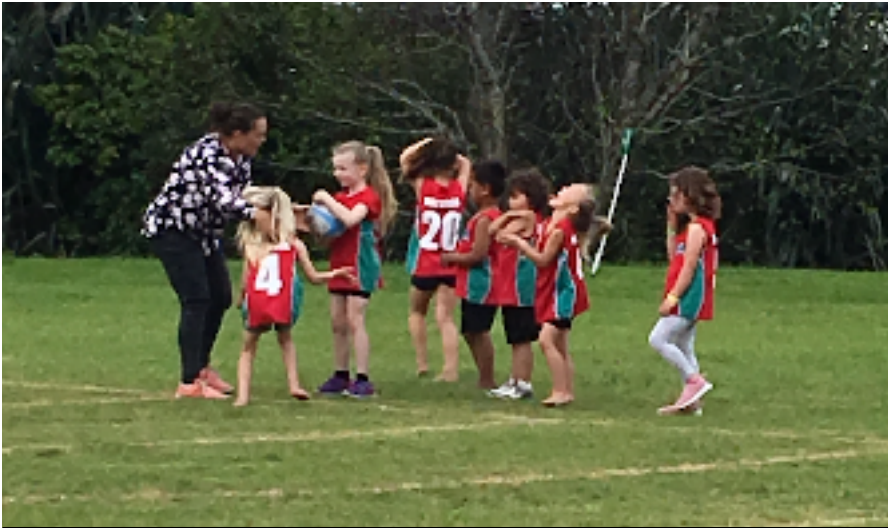
Moturoa Lions first touch game